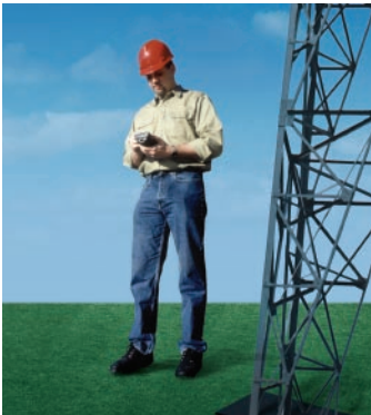
SMART Rounds works in and out of wireless coverage.